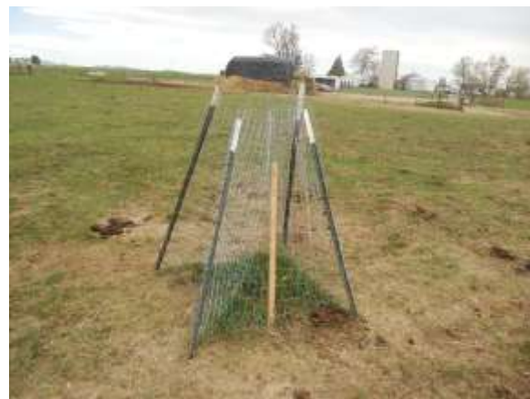
What was once a 4’X4’ exclusion plot, 2014